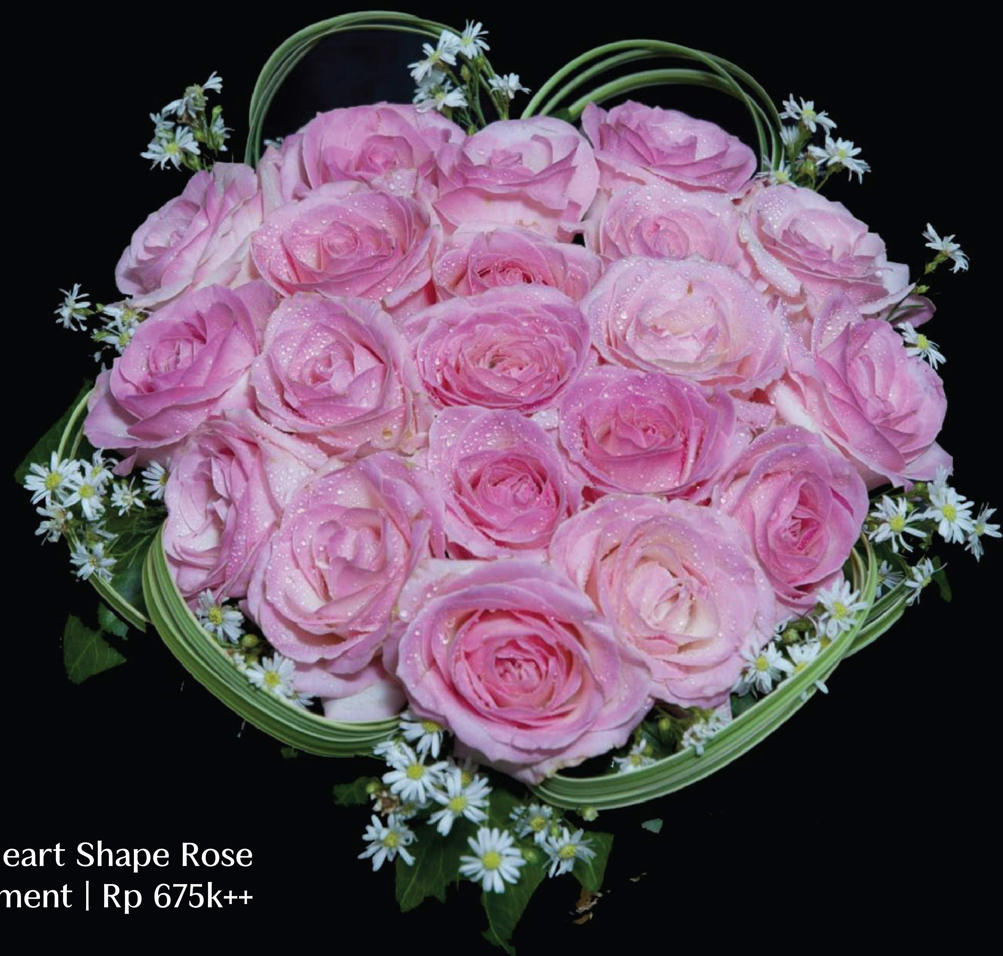
ARR 07 | Heart Shape Rose Sorbet Arrangement | Rp 675k++