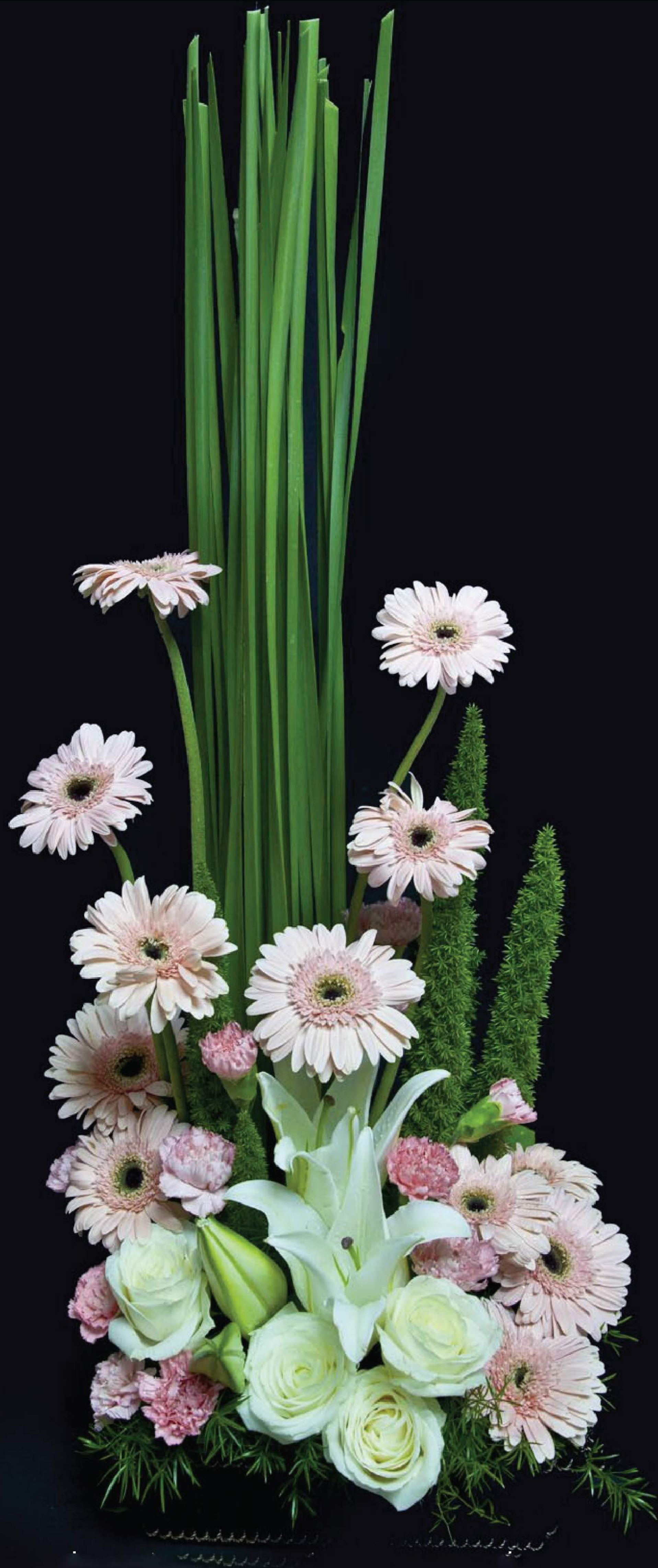
ARR 09 | Canberra Pomstock Arrangement | Rp 900k++