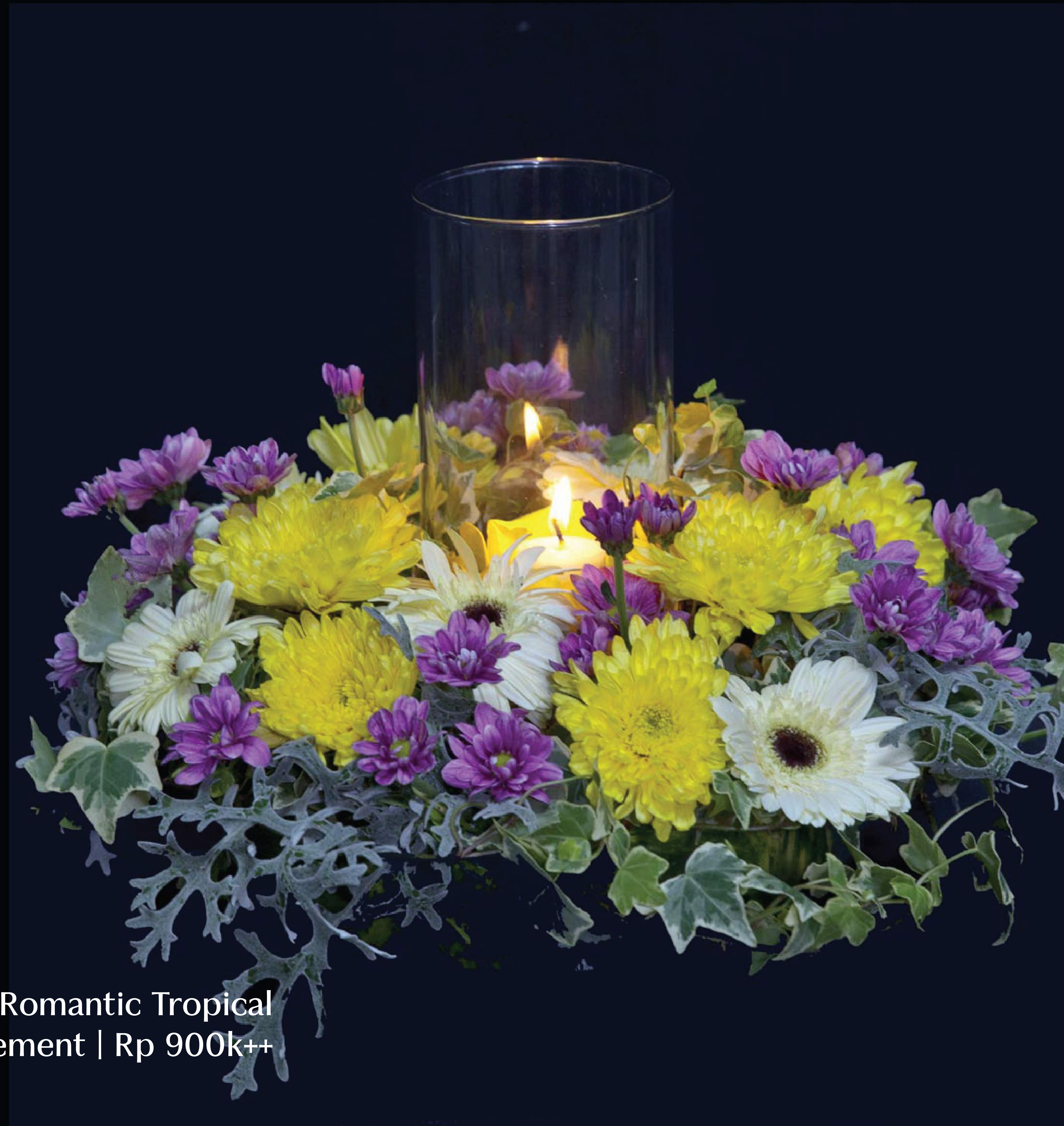
ARR 11 | Romantic Tropical Arrangement | Rp 900k++