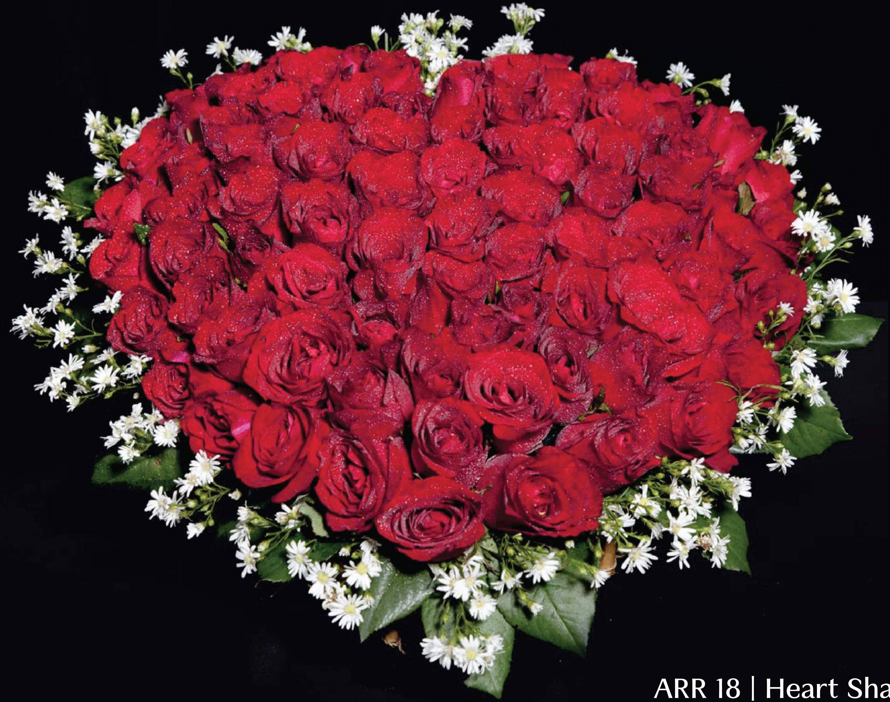
ARR 18 | Heart Shape Red Rose Arrangement | Rp 2,250k++