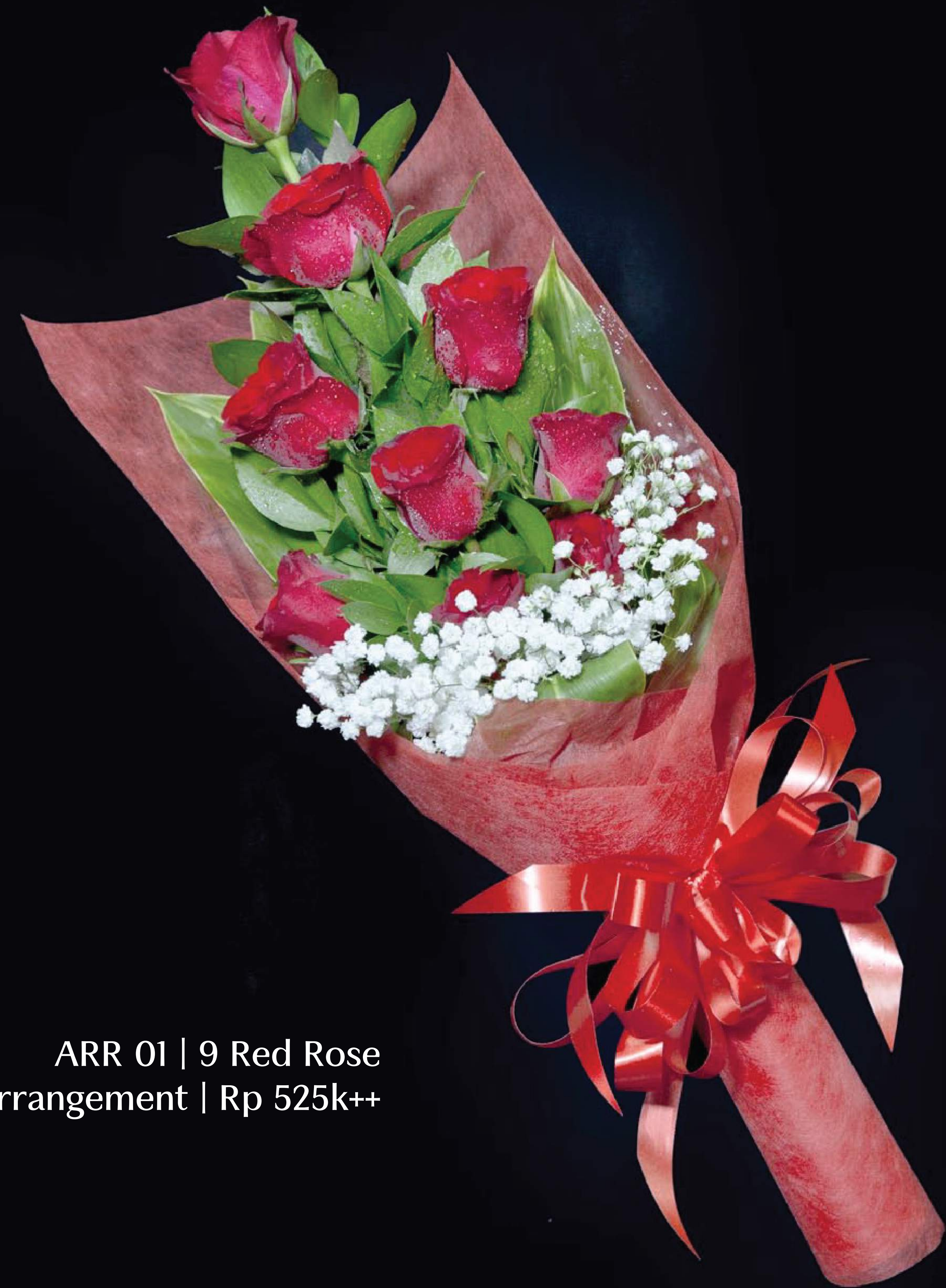
ARR 01 | 9 Red Rose Arrangement | Rp 525k++