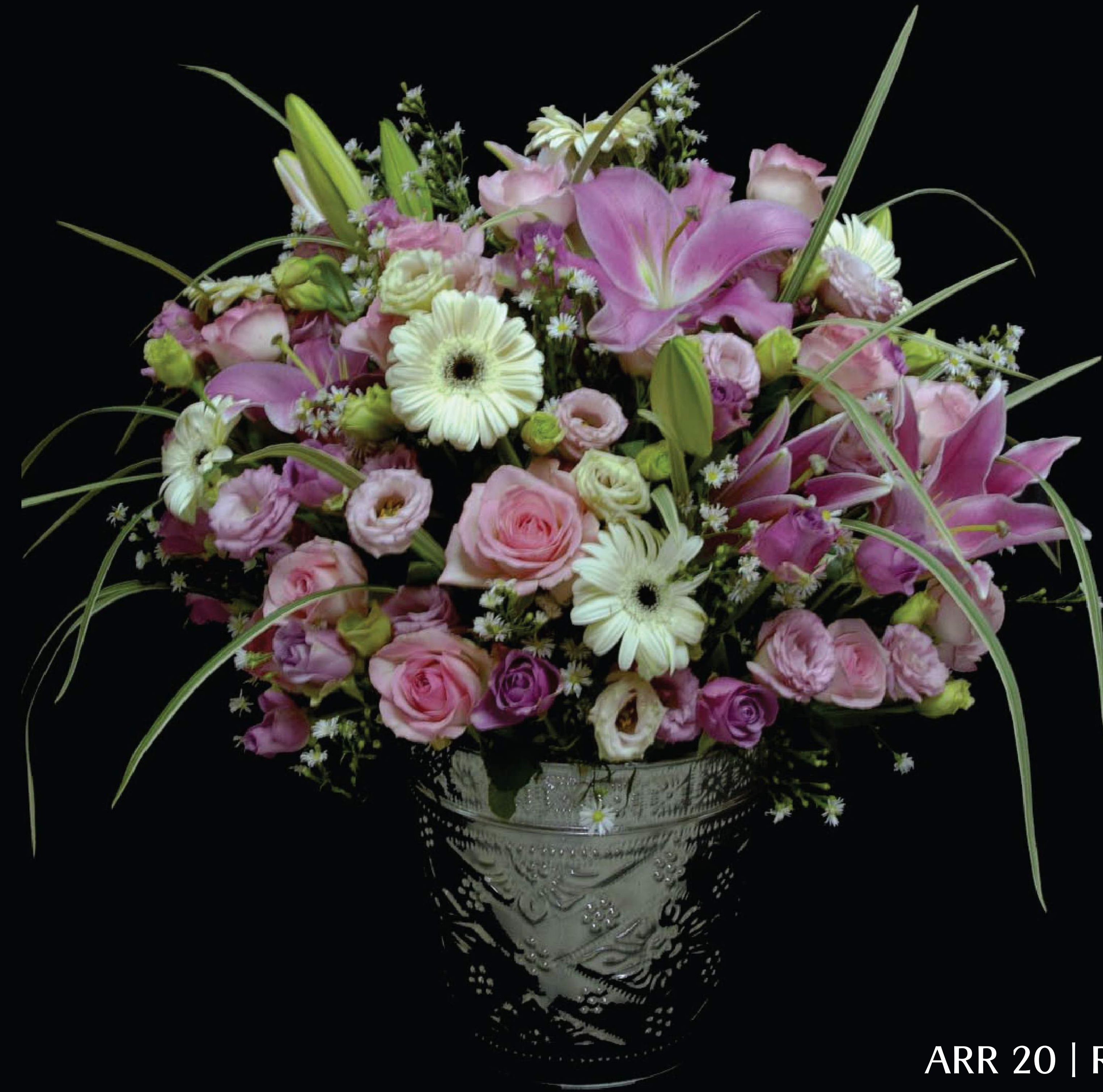
ARR 20 | Rose Sorbet Asiatic Arrangement | Rp 3,375k++