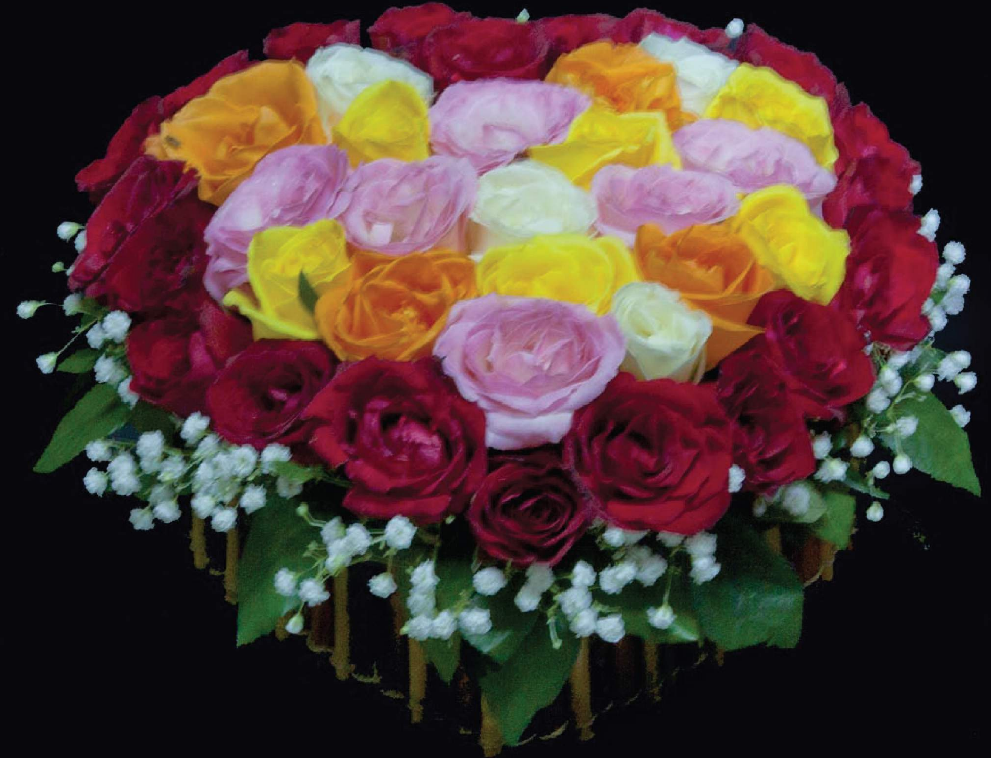
ARR 12 | Heart Shape Rose Combination Arrangement | Rp 1,050k++