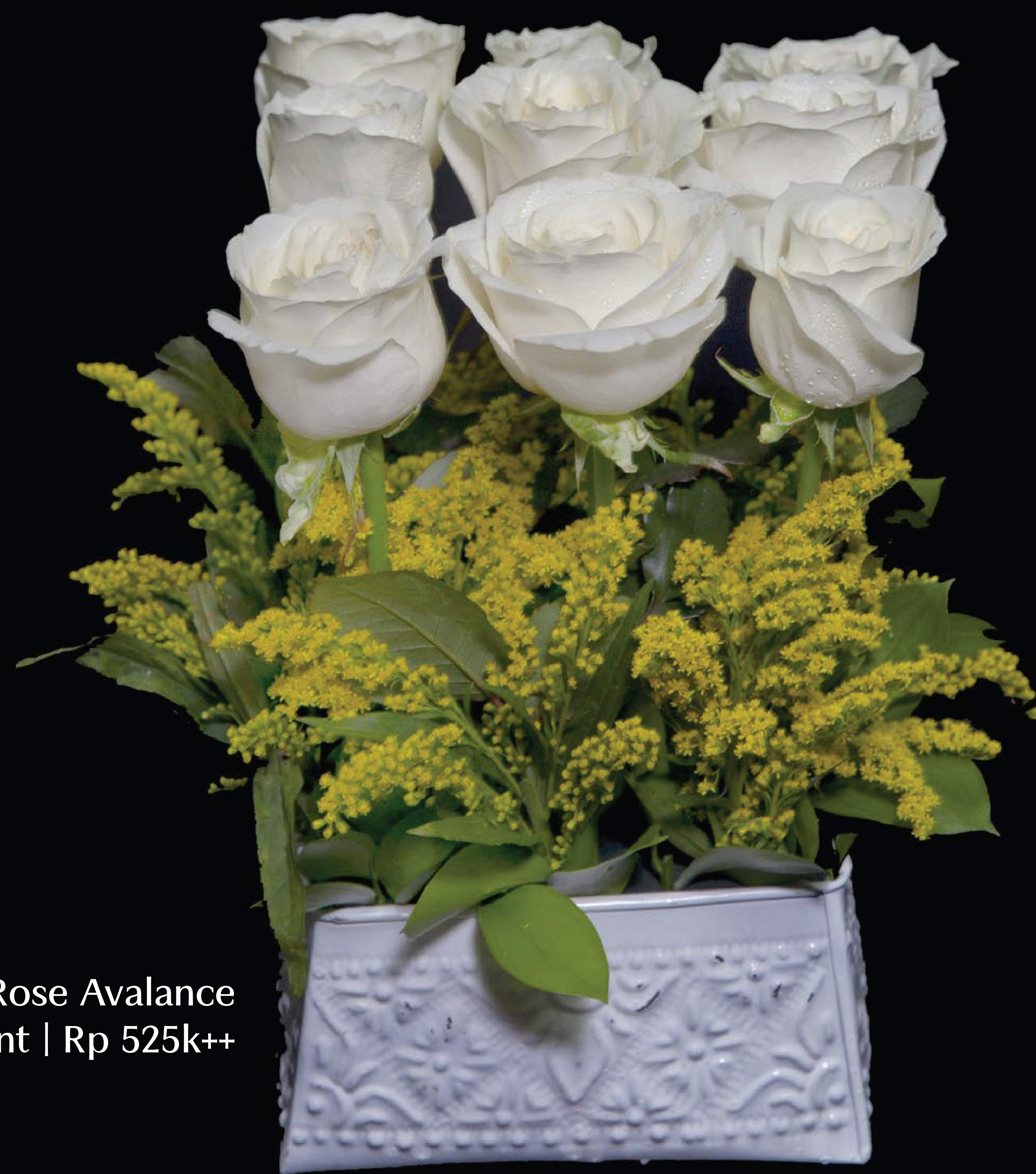
ARR 05 | Rose Avalance Arrangement | Rp 525k++