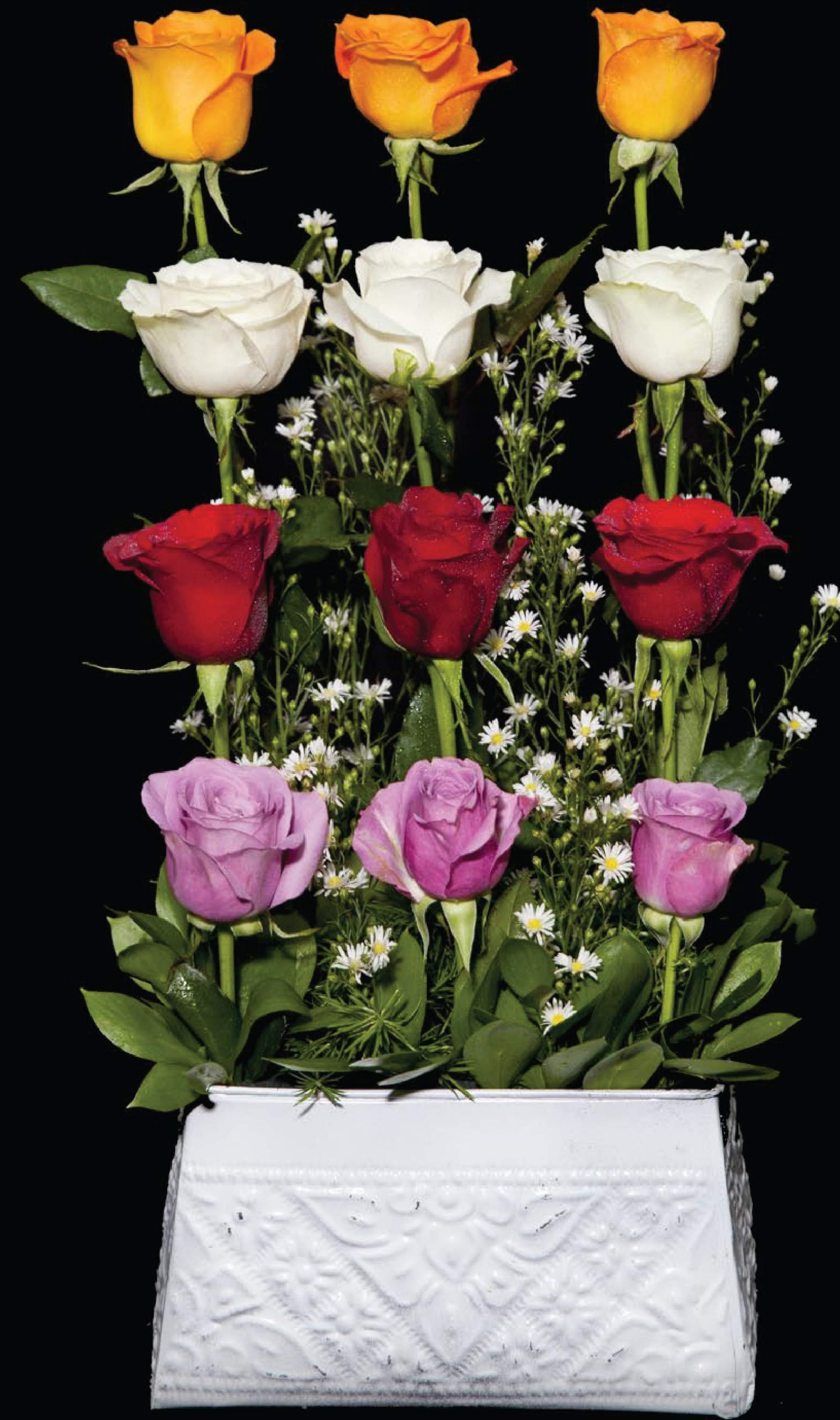
ARR 04 | Combination Rose Arrangement | Rp 525k++