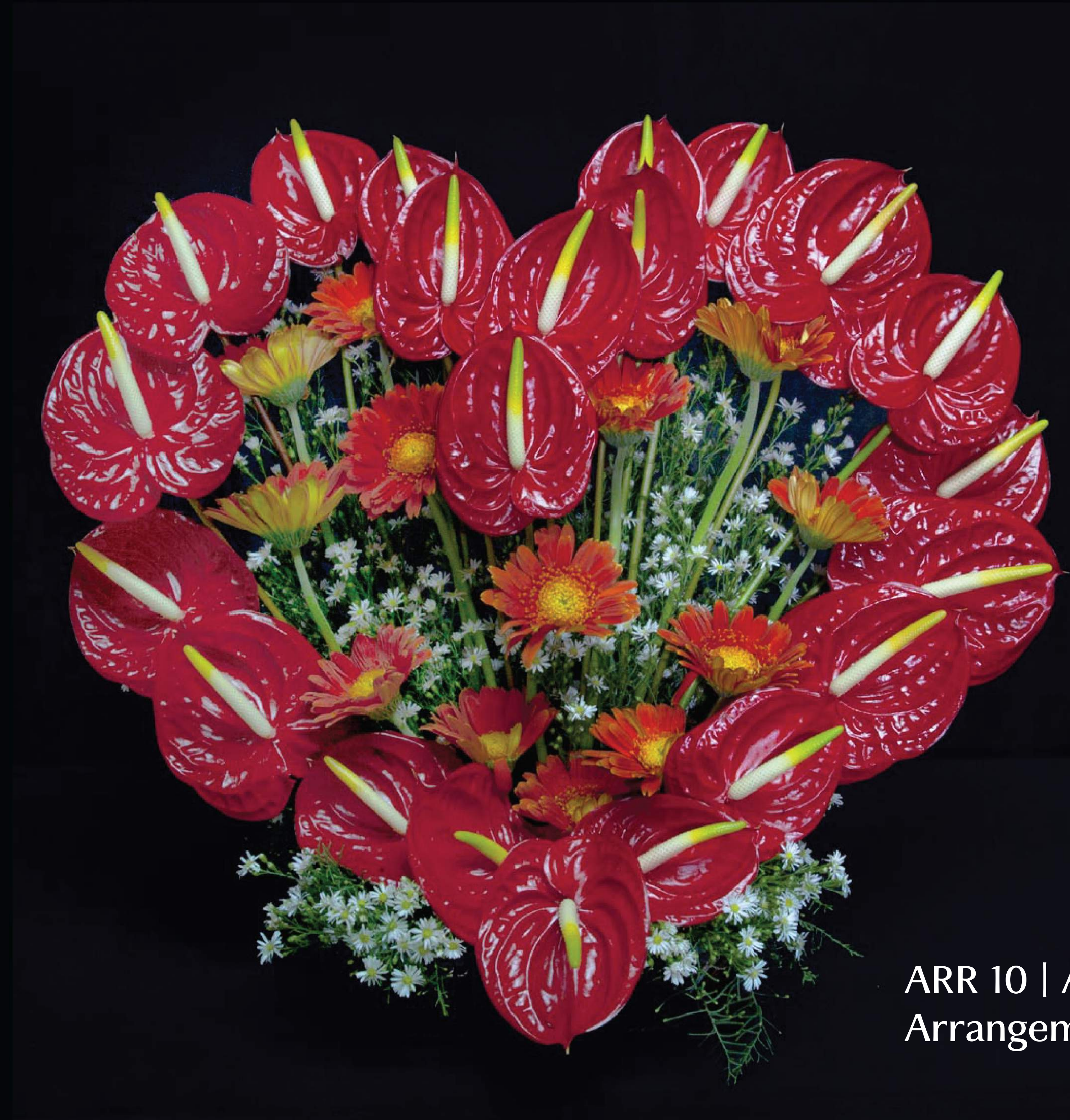
ARR 10 | Anturium Heart Shape Arrangement | Rp 900k++