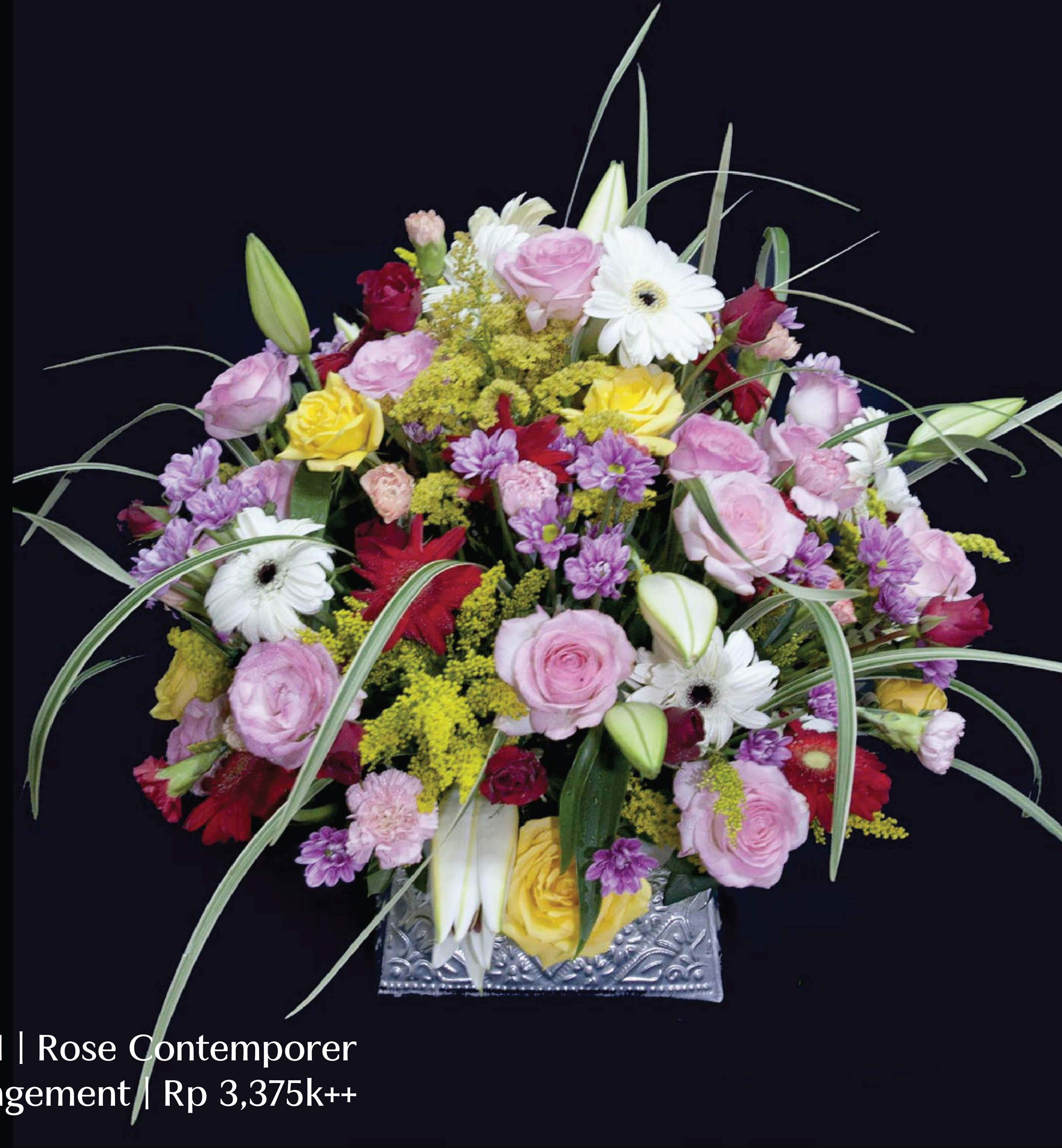
ARR 21 | Rose Contemporer Arrangement | Rp 3,375k++