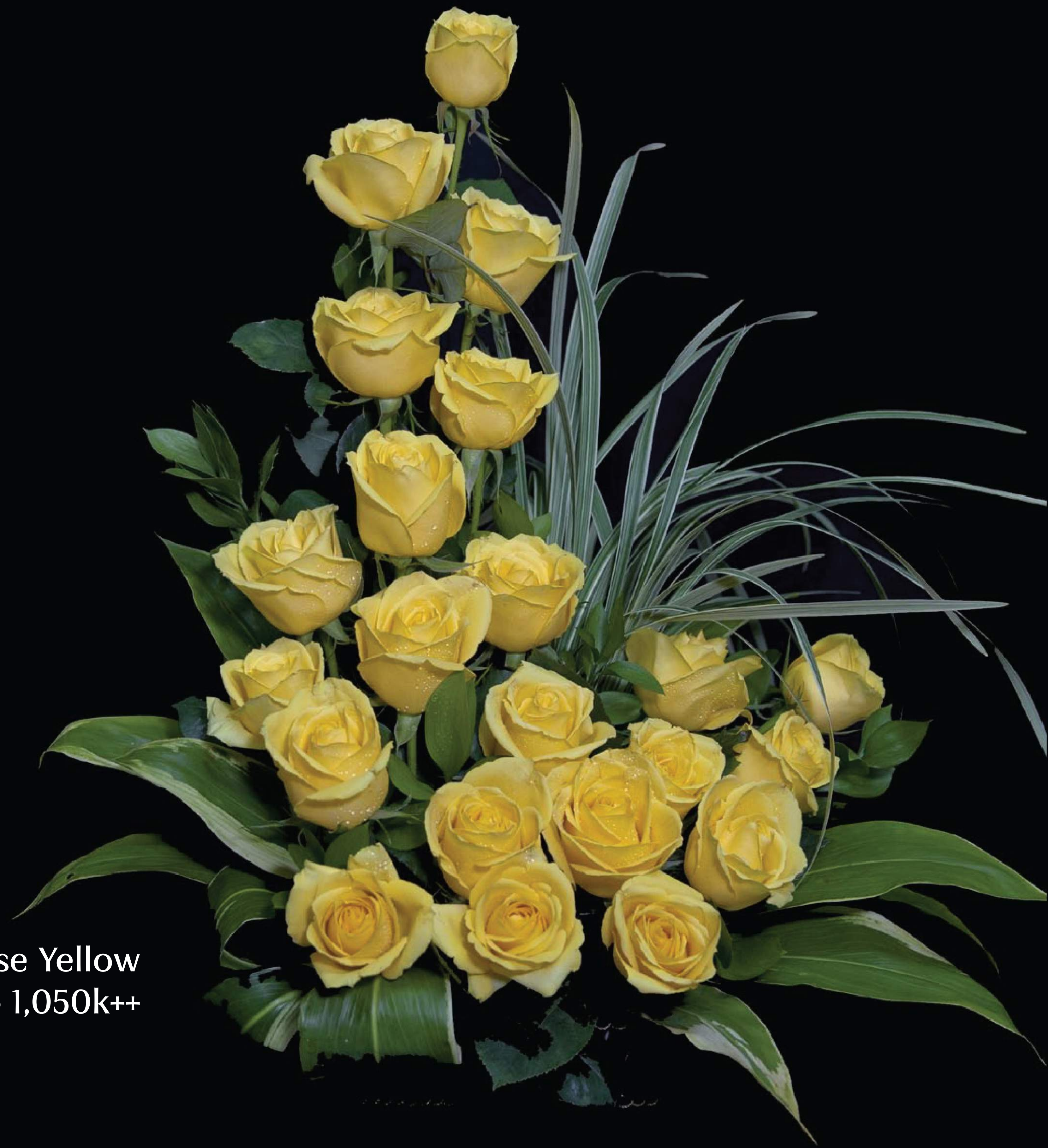
ARR 13 | Rose Yellow Arrangement | Rp 1,050k++