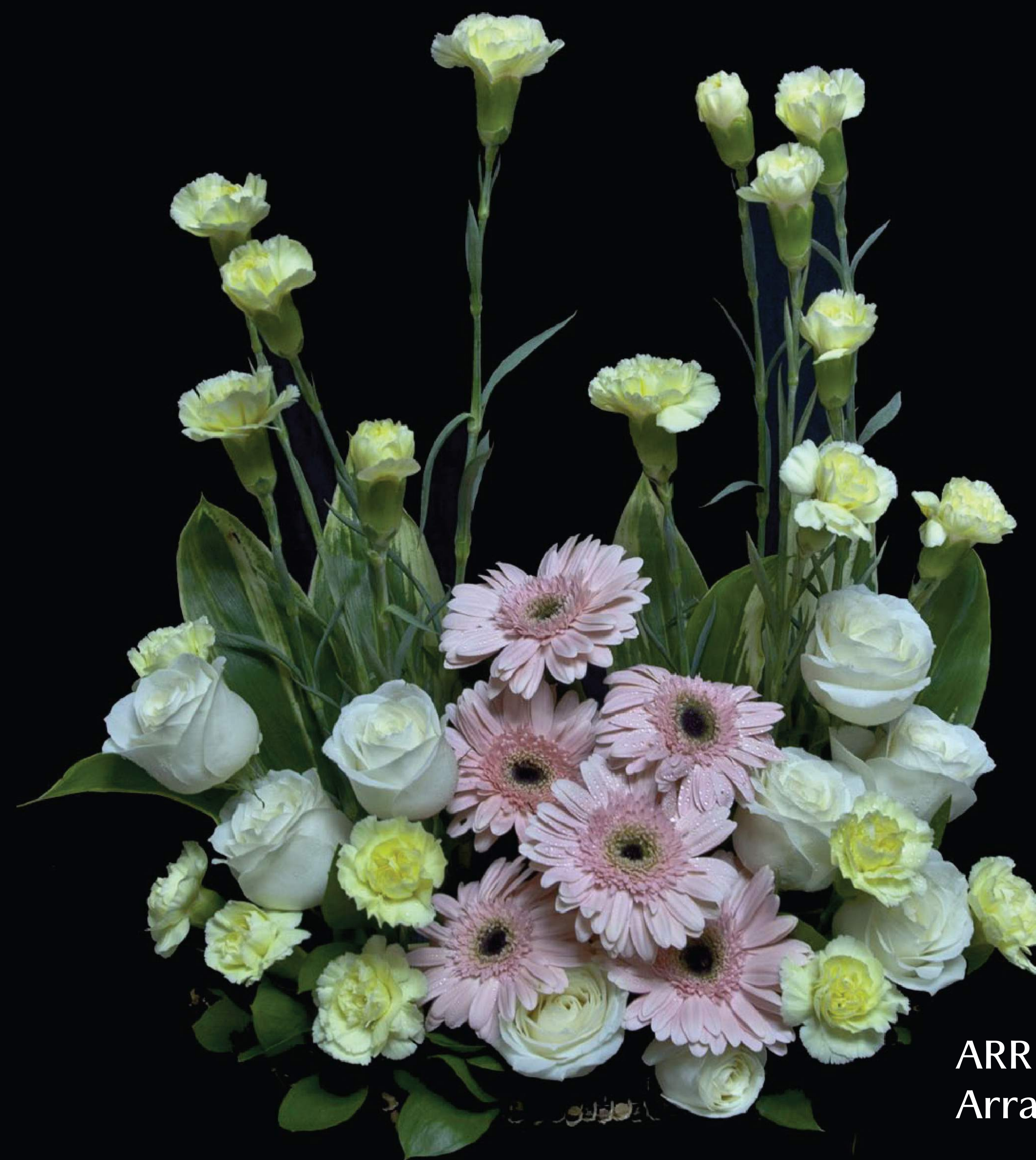
ARR 08 | Rose Avalance Arrangement | Rp 675k++