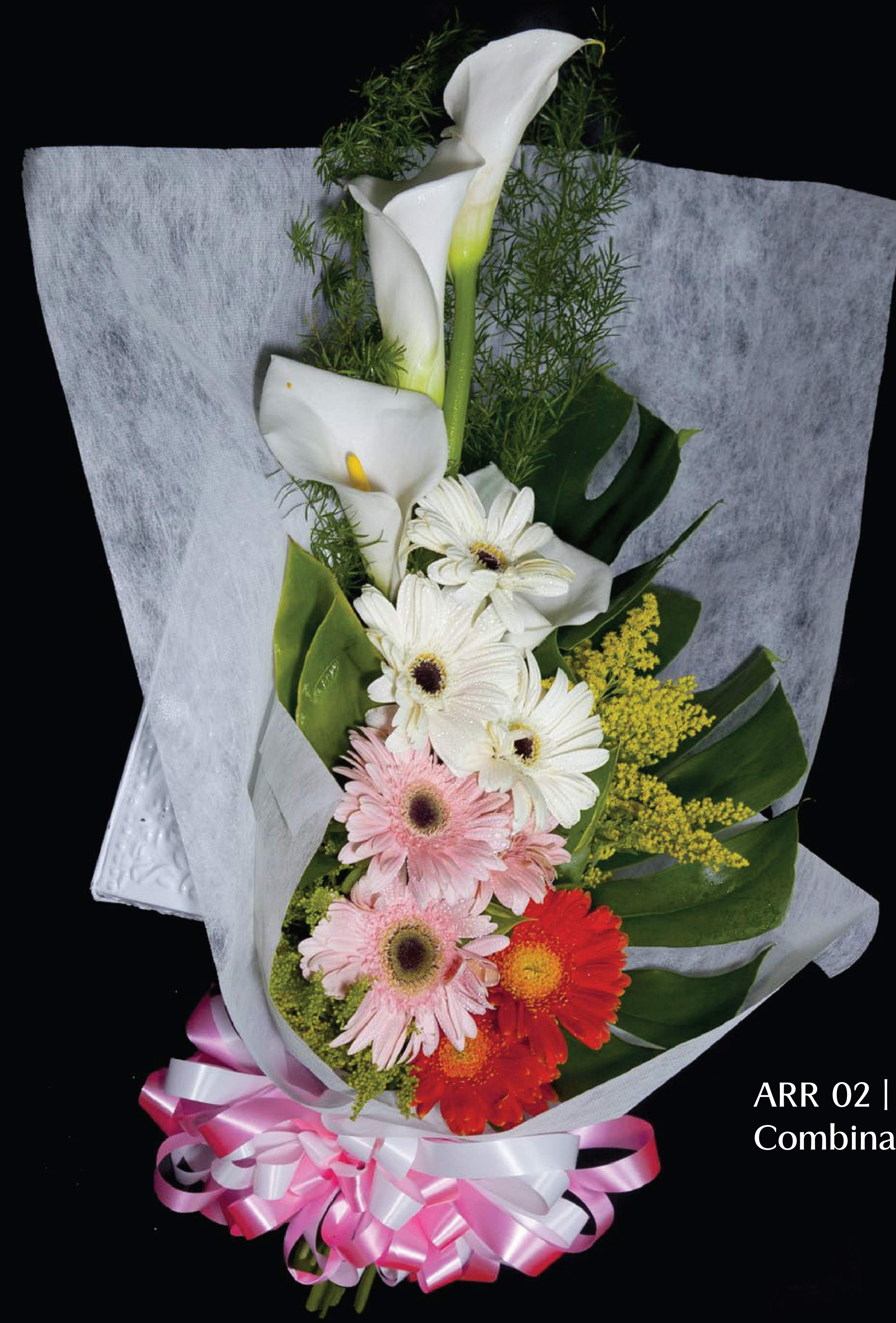
ARR 02 | Hand Bouquet Combination Canberra | Rp 675k++