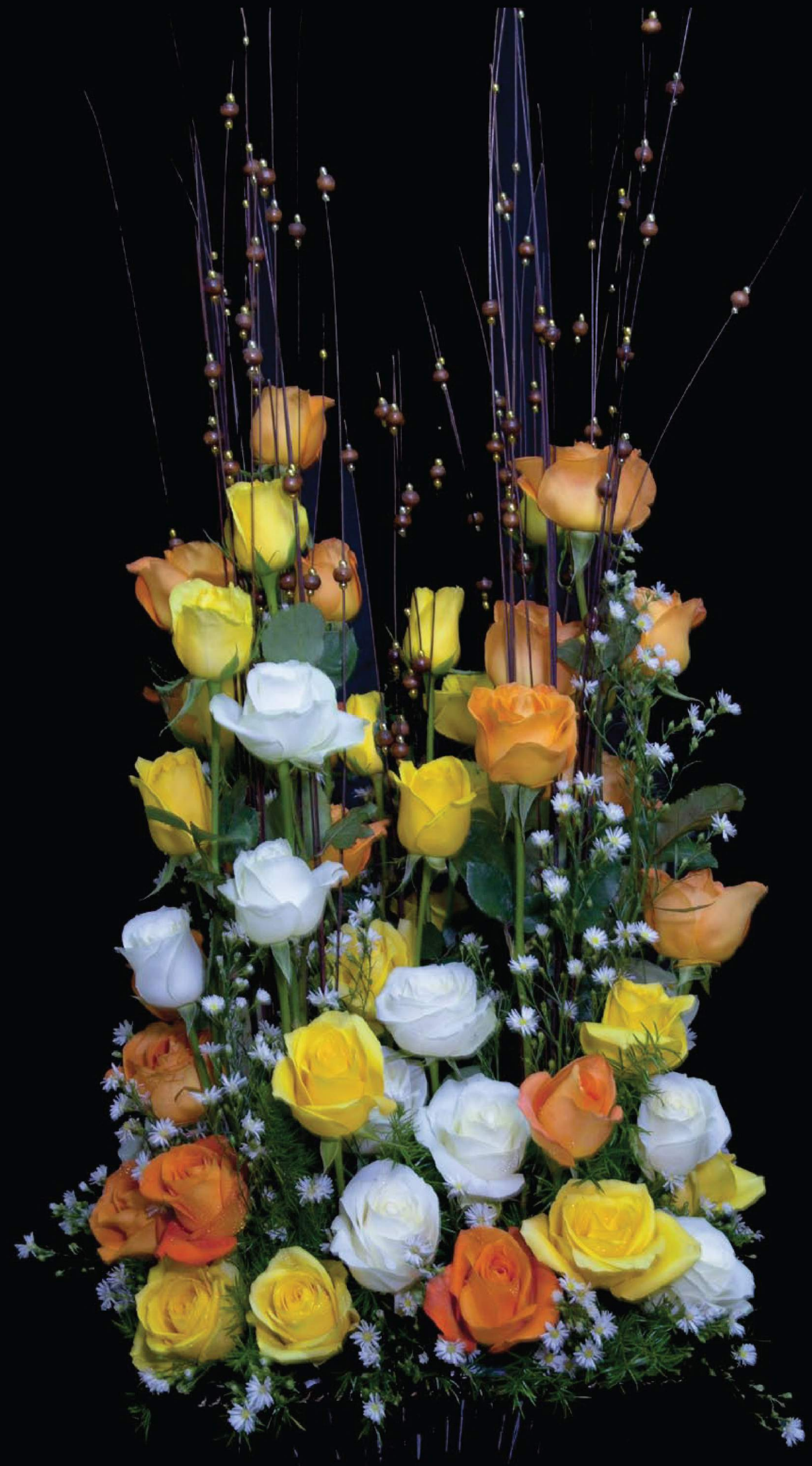
ARR 17 | Rose Stick Arrangement | Rp 2,250k++