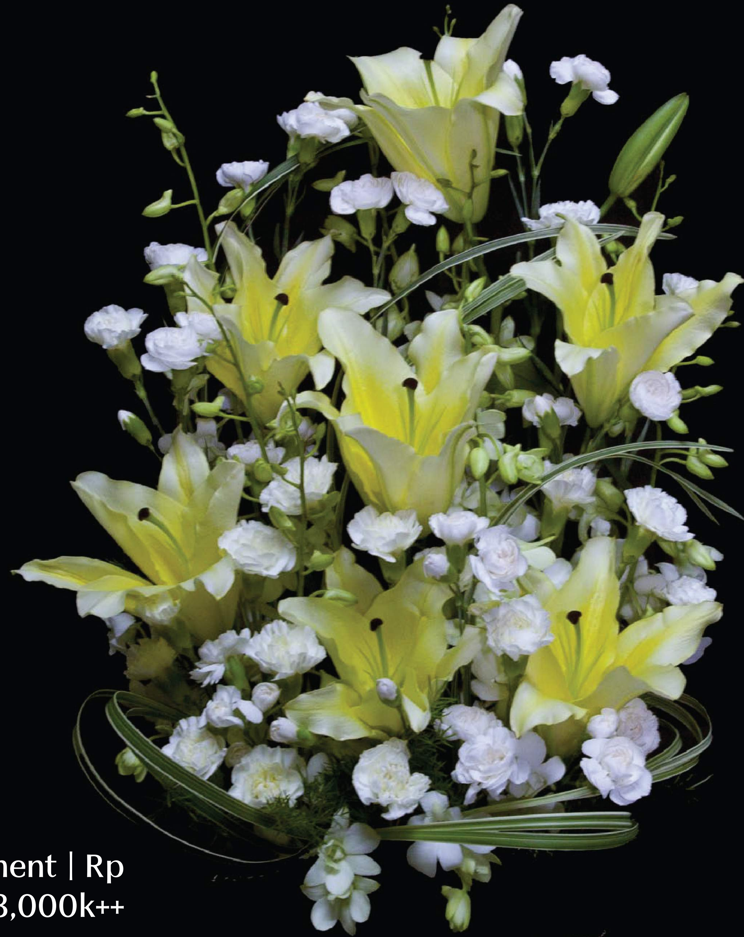
ARR 19 | Carla Arrangement | Rp 3,000k++