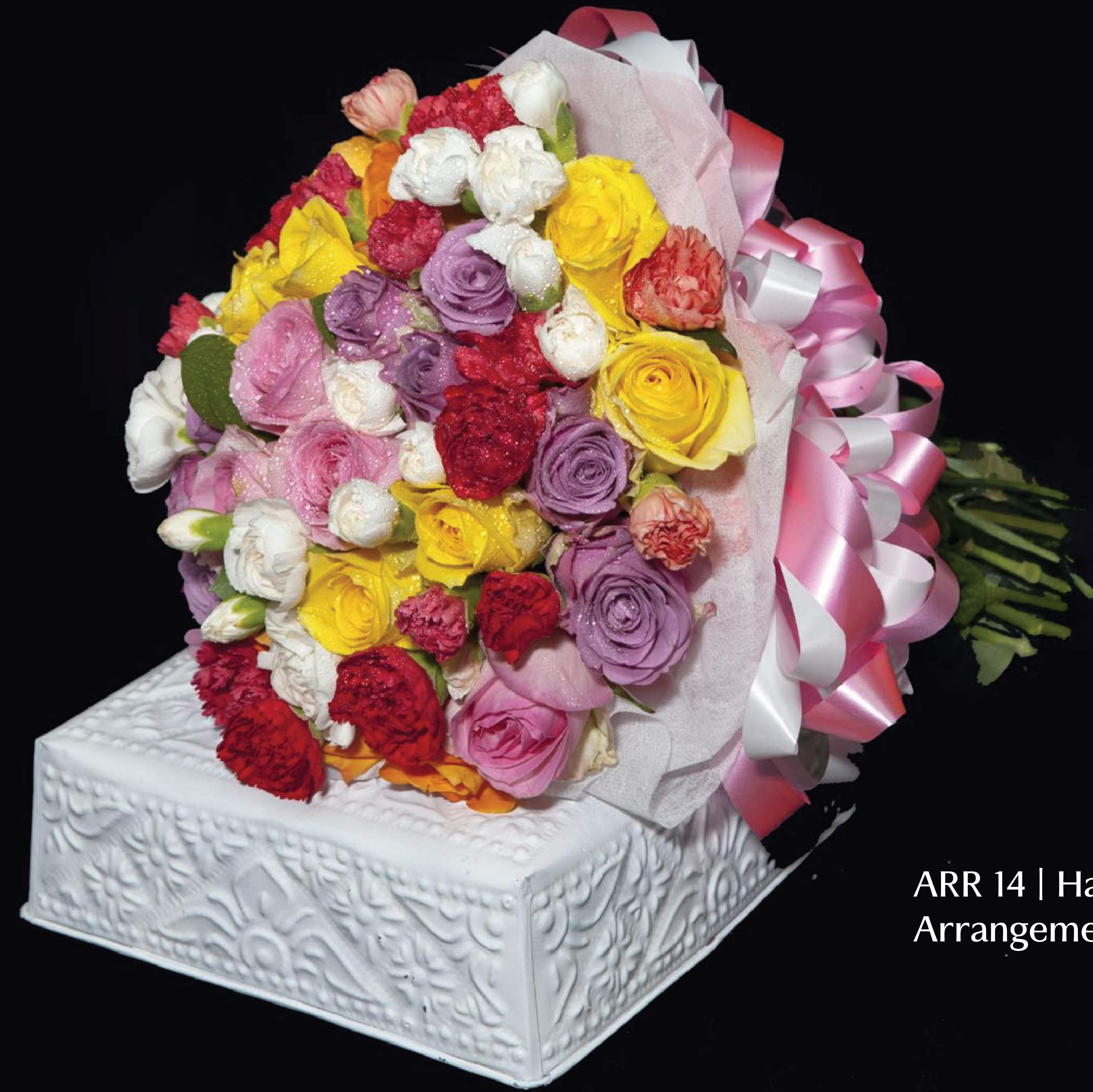
ARR 14 | Hand Bqt Combine Arrangement | Rp 1,050k++