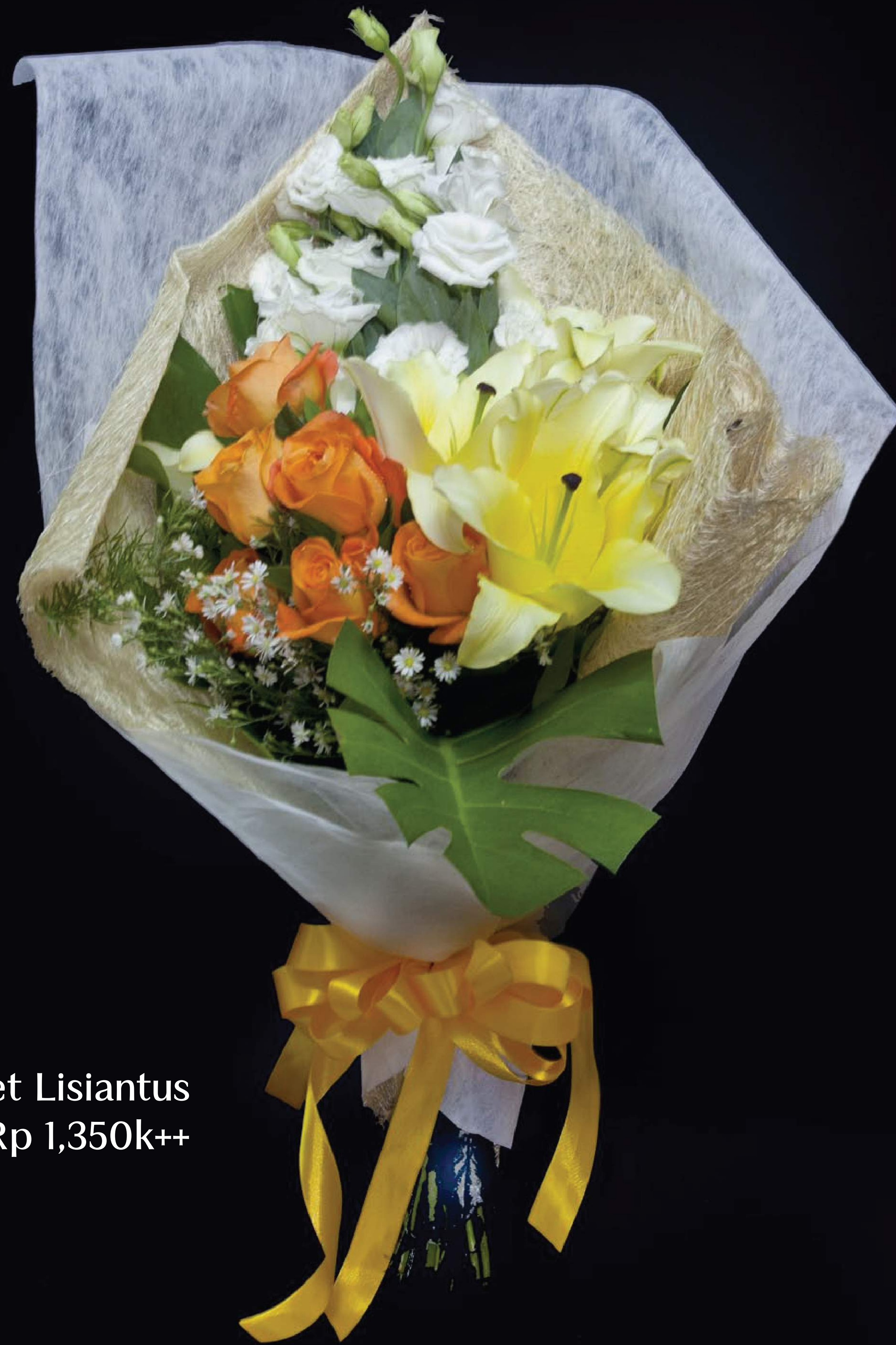
ARR 03 | Hand Bouquet Lisiantus Arrangement | Rp 1,350k++