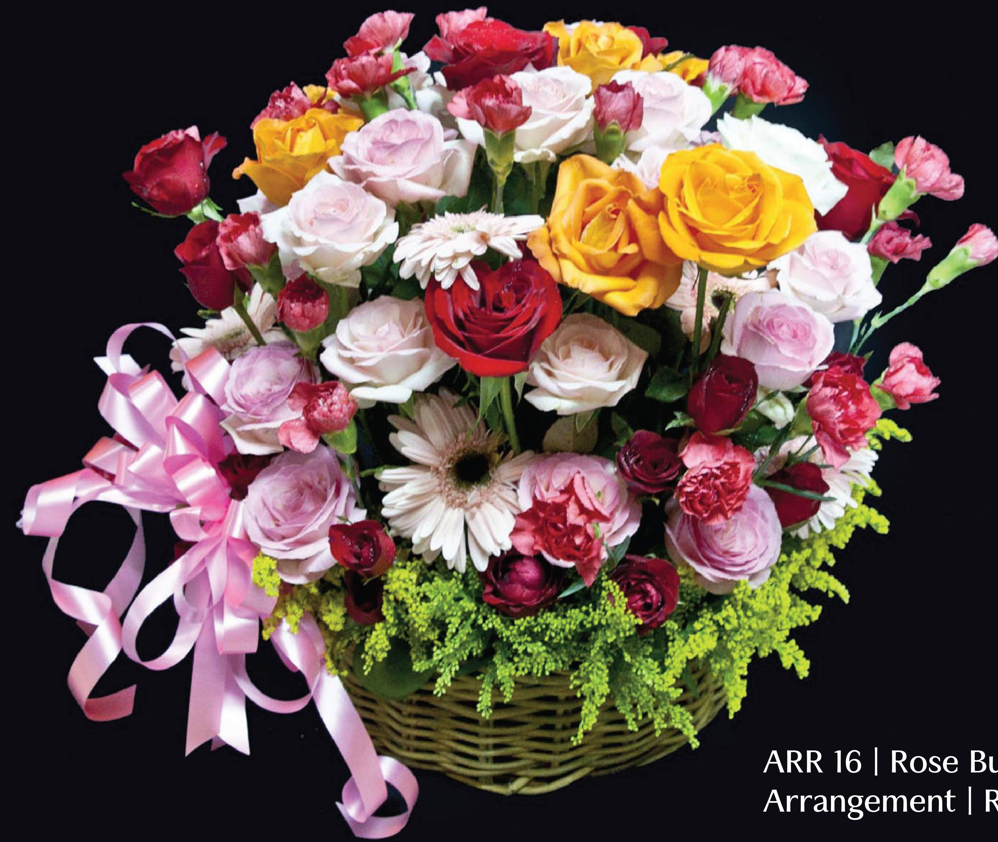
ARR 16 | Rose Bucket Arrangement | Rp 1,875k++