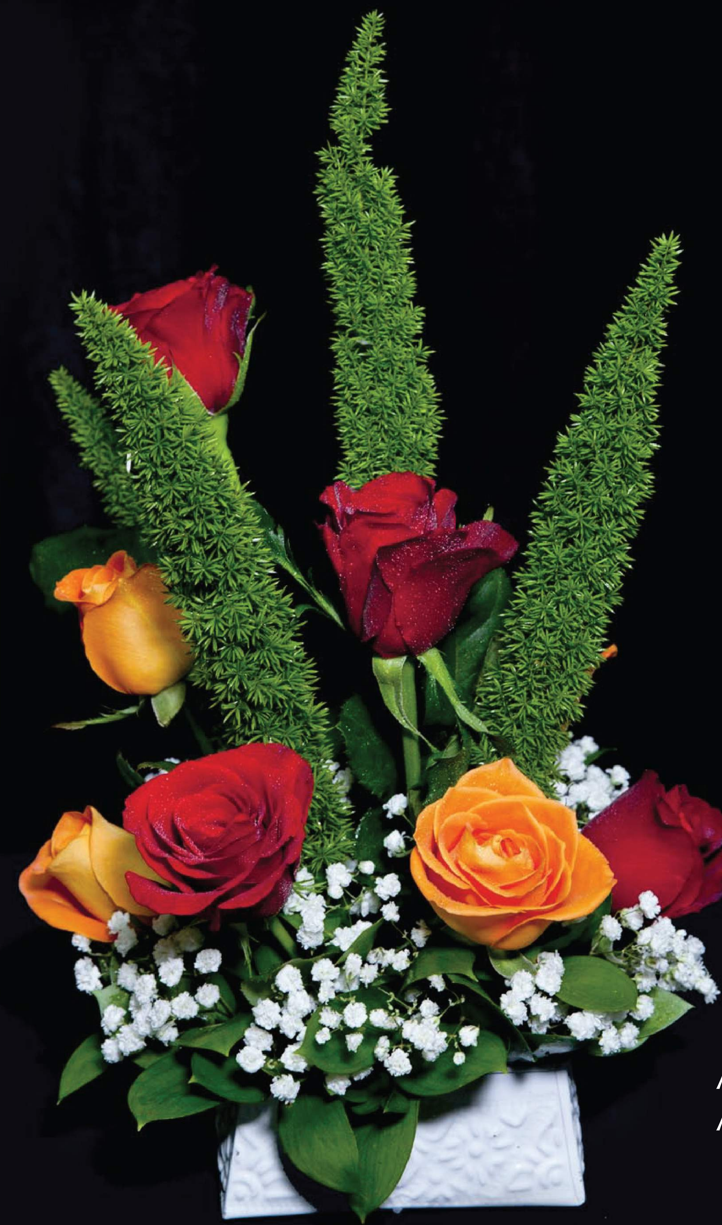
ARR 06 | Red Rose Ekor Tupai Arrangement | Rp 525k++