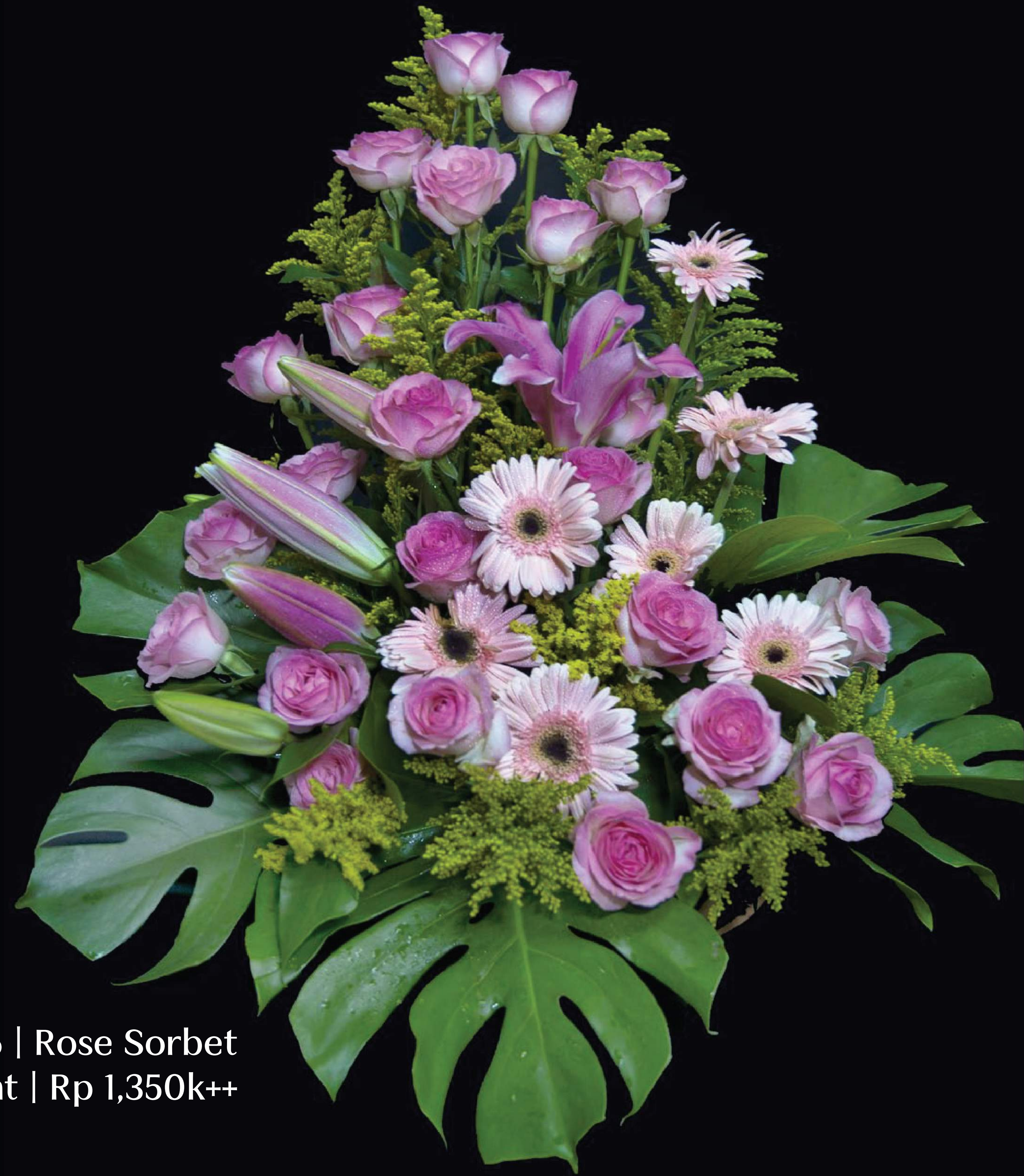
ARR 15 | Rose Sorbet Arrangement | Rp 1,350k++