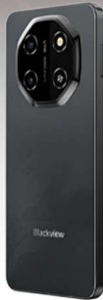
Black View Shark 6