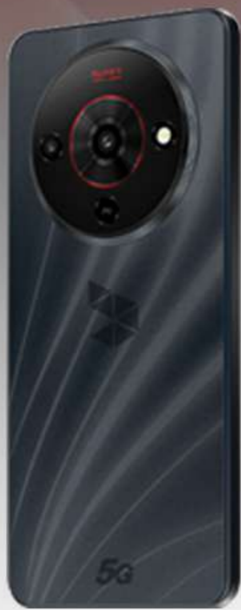
Dialog A76 5G