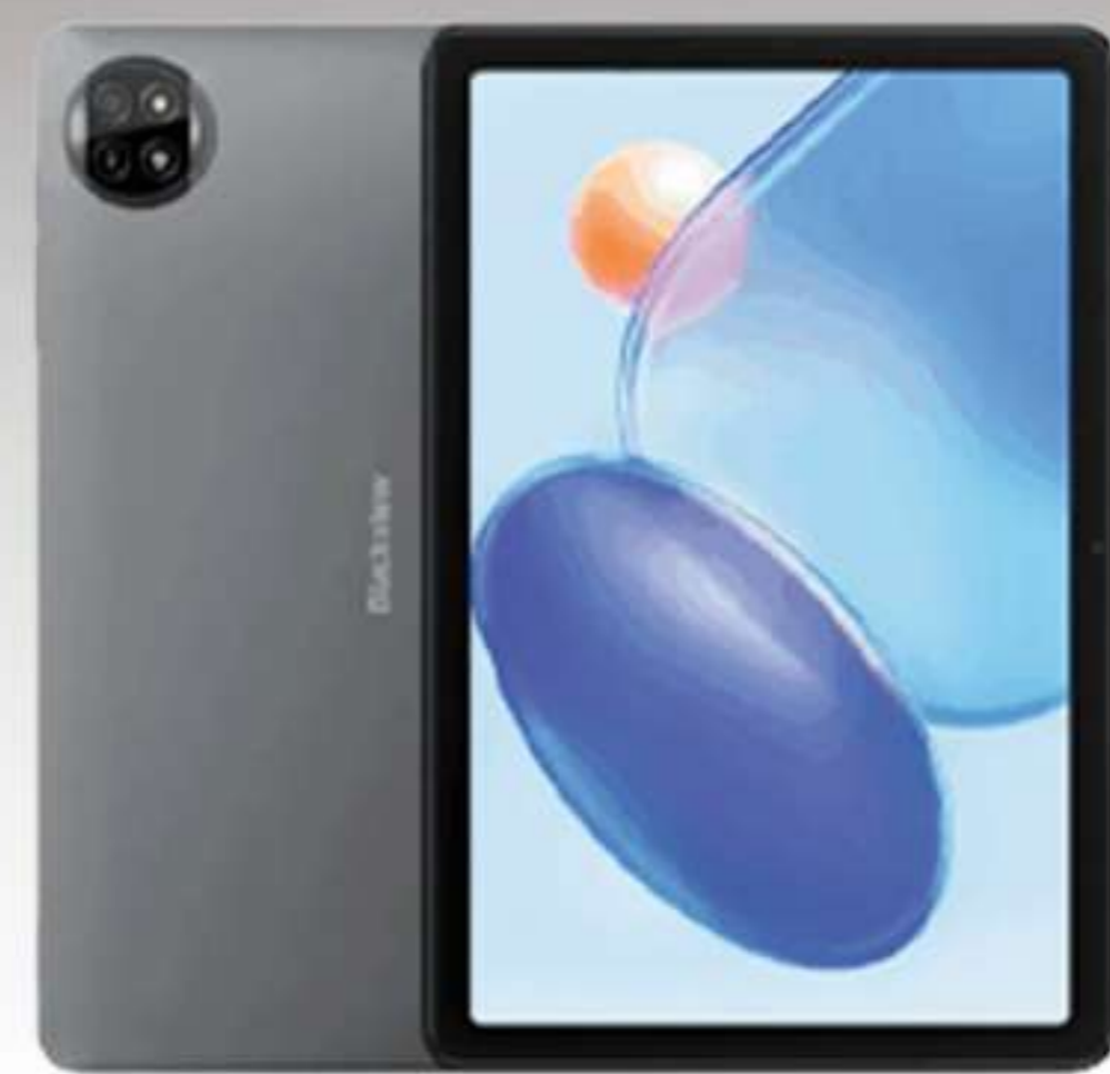
Black View Zeno 10