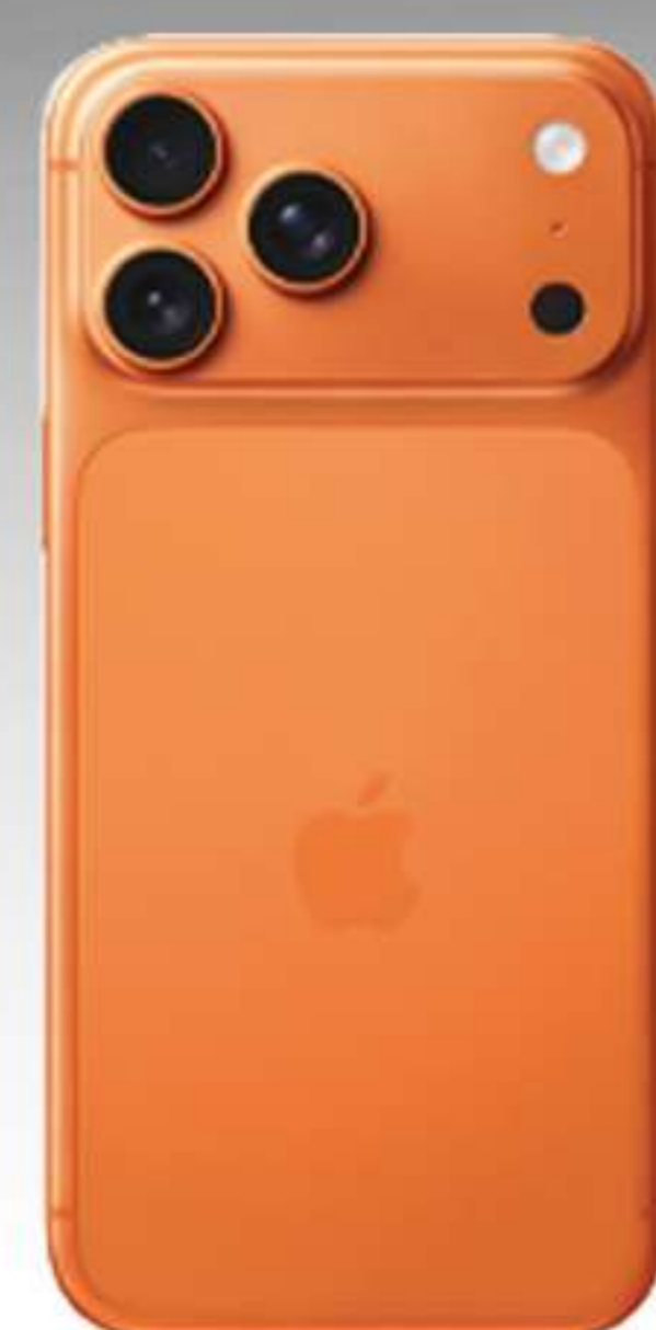
iPhone 17 Pro Max