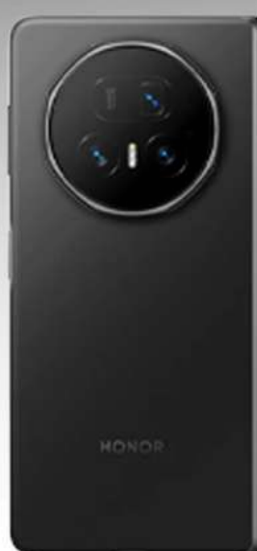
Honor Magic V5