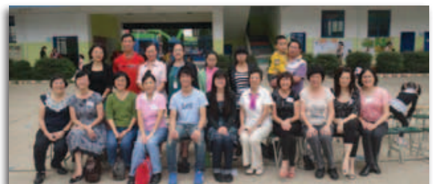
The GBC team with some of the teachers at Baima.