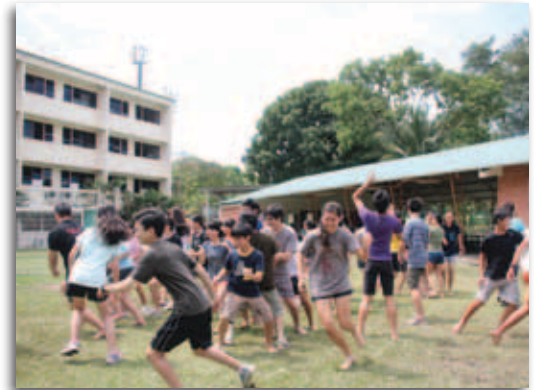
Our youths had great fun at the camp!