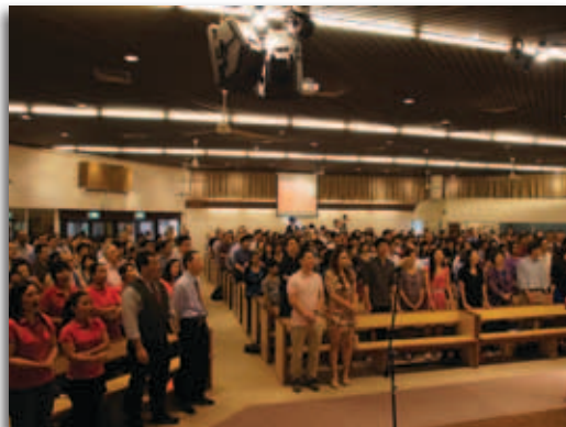
The church offered worship as a gift to Jesus this Christmas.