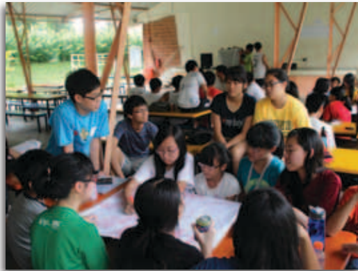
Brainstorming on what it means to be united as a church.