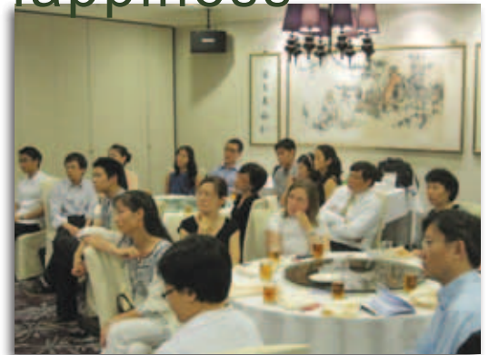
A rapt audience.