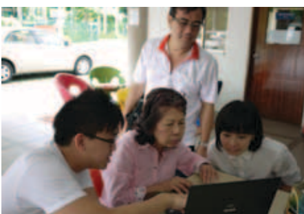
There was a good teacher-student ratio on Gadgets Day.