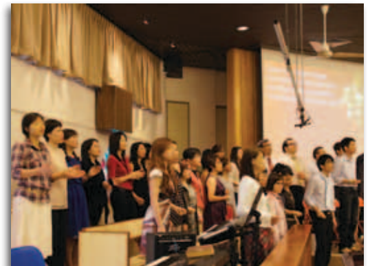
Songs of worship a cappella - the human voice is indeed the greatest musical instrument created by God!