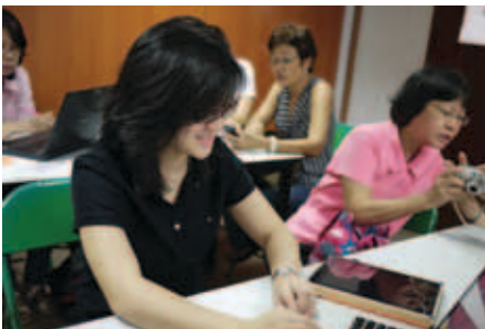
Participants getting advice from young savvy members on the use of their handphones, cameras and laptops.