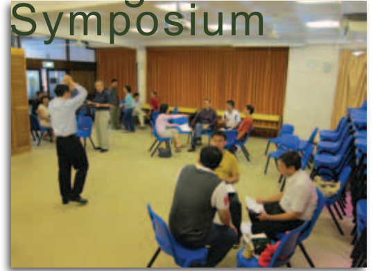
Evangelical outreach programmes conducted in 2011 were reviewed.