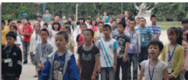
Students of Baima having their morning assembly.

Please pray that the seeds sown may grow and bear fruit. Ω