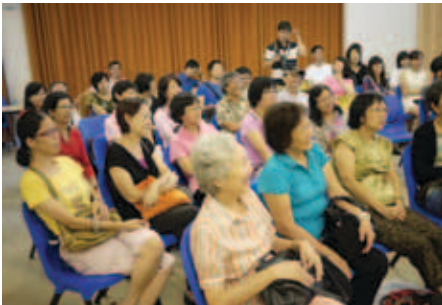
There was a great turnout of seniors on Gadgets Day.