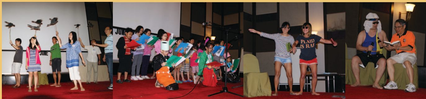
GBC campers put their best foot forward for Talent Night!