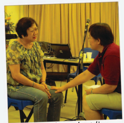
Participants practised the principles taught through small group discussions and role play.