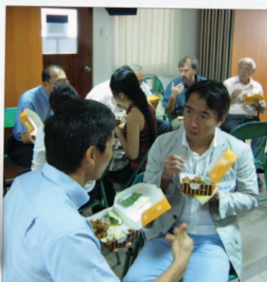
Newcomers had a great opportunity to get to know members and other newcomers.