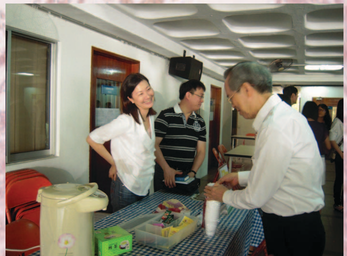
Drinks, snacks, smiles and friendly conversation available outside Numbers Room.

"Do not forget to show hospitality to strangers, for by so doing some people have shown hospitality to angels without knowing it."