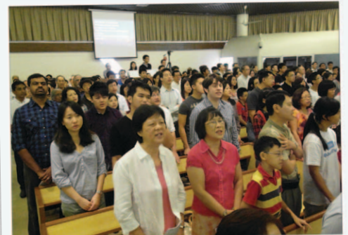
With one heart and one voice, the GBC family rejoiced on Easter Sunday that "Our God is all in all".