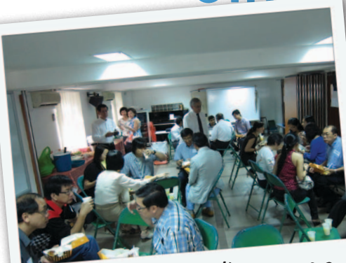
Prise God for all the newcomers.