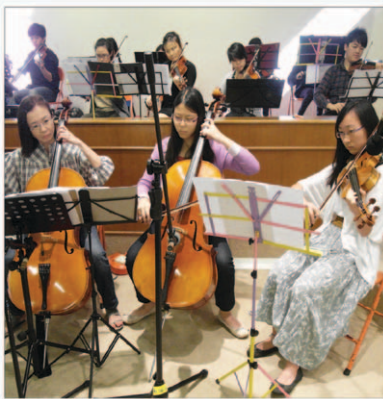
A string ensemble accompanied the Good Friday worship service.

Good Friday 6 Apr and Easter Service 8 Apr 2012