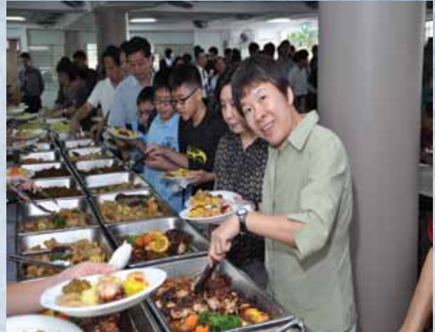
The celebration is never complete without a fellowship lunch!