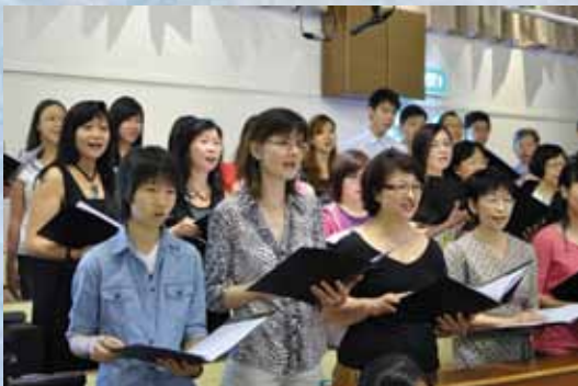
The choir giving wonderful praise to God.