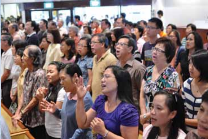
The GBC family celebrated its 52nd anniversary with a hall overflowing with worshippers.