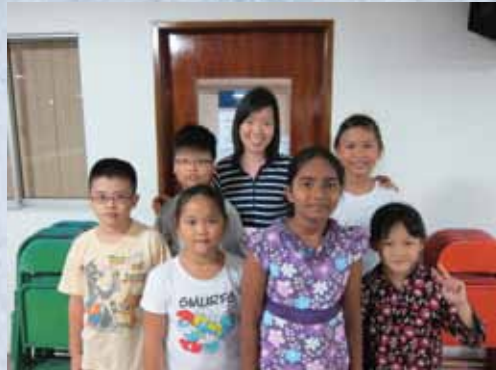
We have a growing number of students to teach.

The children and their parents have touched every volunteer who teaches or who serves in