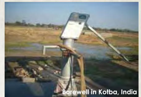
Borewell in Kotba, India

These wells have not only been a physical blessing to the people, but have also opened doors to allow the OM India team to share freely about the Gospel and their personal testimonies. For Jesus said in John 4:13-14: "People