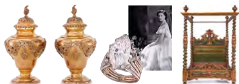
A pair of Edward VII silver-gilt casters