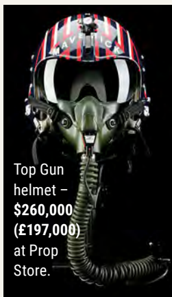
Top Gun helmet - $260,000 (£197,000) at Prop Store.