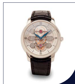
A RARE GIRARD-PERREGAUX PLATINUM TOURBILLON

Hammer Price and 24% Buyer's Premium are inclusive of 7% GST. Hotlotz can remove all GST for buyers who are non-resident in Singapore, providing we manage the export and it is completed within 60 days of the auction closing date.