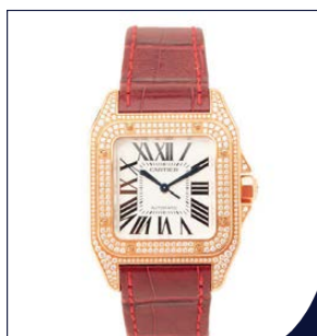
A CARTIER GOLD AND DIAMOND SANTOS 100