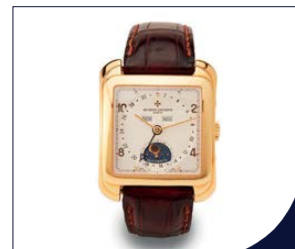
A VACHERON CONSTANTIN TOLEDO 1952