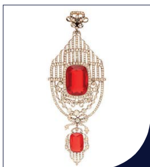
A LARGE FIRE OPAL AND DIAMOND PENDANT