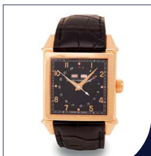
A GIRARD-PERREGAUX VINTAGE 1945 TRIPLE CALENDAR