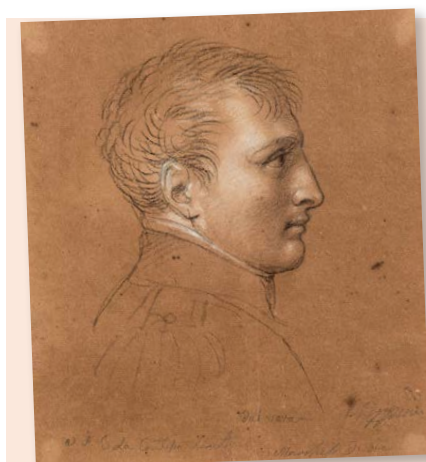
Left: Portrait of Napoleon by Andrea Appiani, c.1800 – estimate £40,000-60,000 at Bonhams on October 27.

info@koopman.art +44 (0)20 7242 7624 www.koopman.art