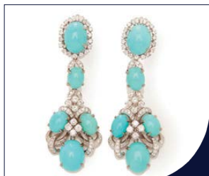
A PAIR OF LARGE TURQUOISE AND DIAMOND EARRINGS