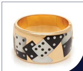
A TIFFANY & CO. BANGLE BY ANGELA CUMMINGS