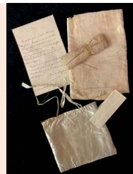
Above, l to r: Napoleon's stockings (€21,500/£18,700), his shirt (€80,000/£69,600) and items including a 'strip stained with his blood during his autopsy' (€27,000/£23,500), all sold at Osenat on May 6.