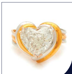
A 5.24 CARAT HEART-SHAPED DIAMOND SINGLE STONE RING