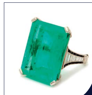
A 38 CARAT COLUMBIAN EMERALD SINGLE STONE RING

INCLUDING AN ESTATE COLLECTION OF JEWELLERY TO BE SOLD AT NO RESERVE - THE PROCEEDS GOING TO CHARITY - AND A SELECTION OF WATCHES FROM A NOTABLE PRIVATE COLLECTION