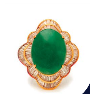
A LARGE TYPE-A JADE AND DIAMOND RING