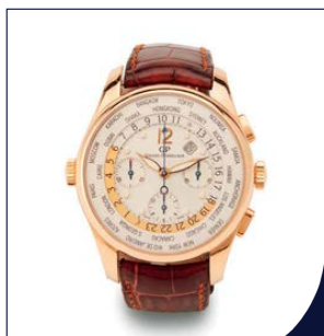
A GIRARD-PERREGAUX WORLD TIME CHRONOGRAPH