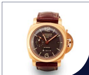
A PANERAI LUMINOR GOLD 8 DAYS POWER RESERVE