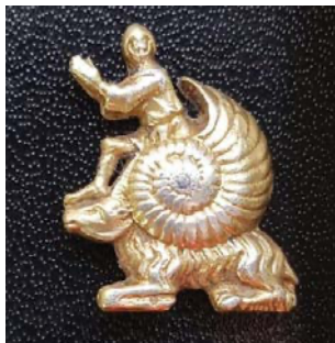
Above: ‘snailman’ from 1200-1350 found in Pontefract, West Yorkshire, last year.

To coincide with the Treasure report released last week, the British Museum also announced recent Treasure finds of significance. These objects, which finders have a legal obligation to report, will now go through the Treasure process – among them is the silver-gilt ‘snailman’ mount (pictured) which Wakefield Museum hopes to acquire.